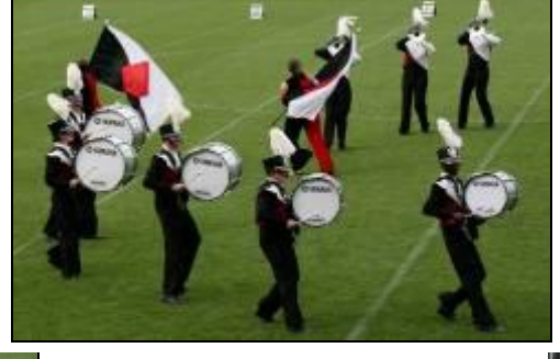
Be the best!